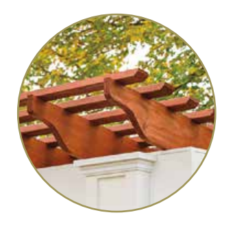
Joists and Purlins 2x8 pine joists with 2x3 pine purlins give ample shade and comfort.