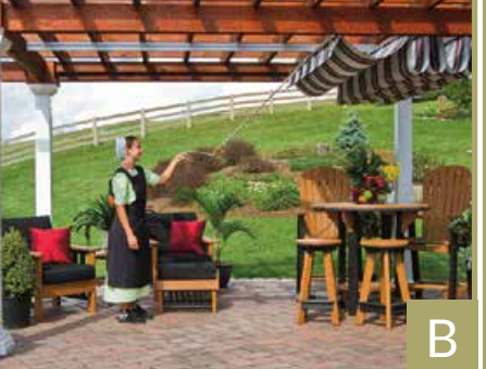
B. Manual Operation Our EZShade Canopy glides smoothly for easy operation.