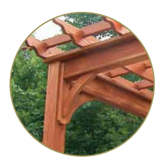
Braces The braces make this pergola a strong and sturdy structure.