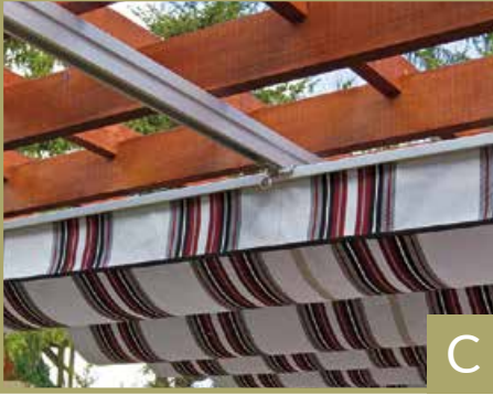
C. Quality Materials Made from stainless steel fasteners, powder-coated brackets, and Sunbrella fabric.