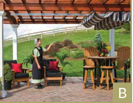
A. Full Coverage Get out of the mid-day sun and enjoy your backyard patio.

Consider adding this EZShade Canopy System to your new or existing pergola. This manually controlled canopy glides effortlessly across the triple track system to shade the entire area. You will find yourself using your patio more often when you can block out that hot mid-day sun, or mild rain. Bring this EZShade Canopy System to your backyard oasis.