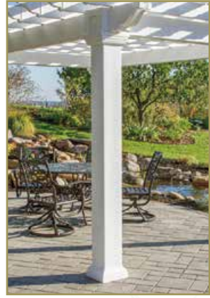
8x8 Post For a robust appearance