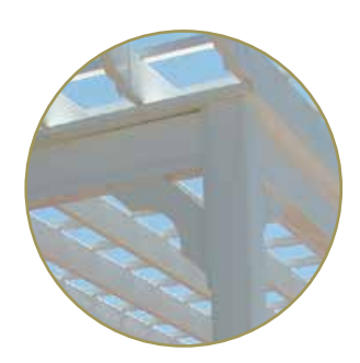
Braces The braces make this pergola a strong and sturdy structure.