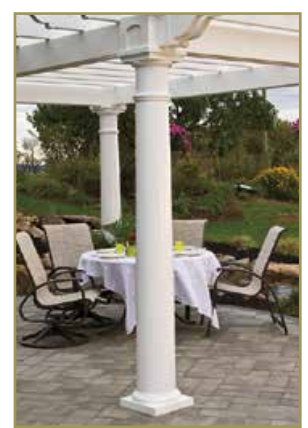
10" Columns Give your pergola a Mediterranean feel