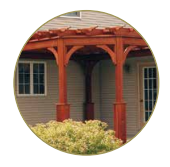
Custom Shapes Do you have a difficult patio or angle? We can help with custom shaped pergolas.