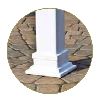
Post Skirts The anchor brackets and bolts are hidden beneath these attractive post skirts.