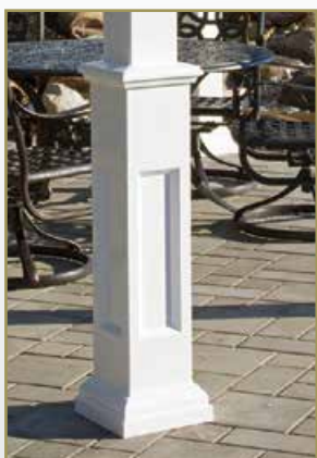
EZShade Canopy See page 22