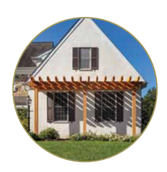
Attached to House We can make most of our pergolas to attach to your home.