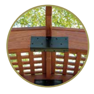
Joist Brackets These powder-coated brackets connect the two-part arched joists together for a strong connection.