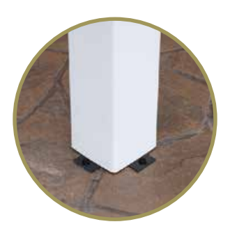
Anchor Brackets Your pergola includes powder-coated anchor brackets and concrete lag bolts.