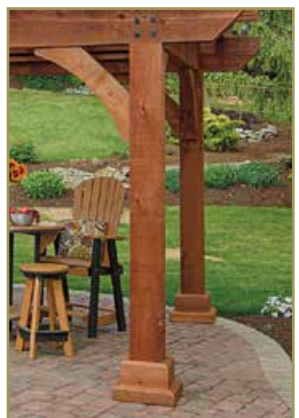
8x8 Wood Post Completes the wood look