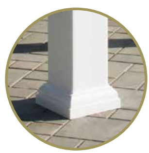
Posts Skirts The anchor brackets and bolts are hidden beneath these attractive post skirts.