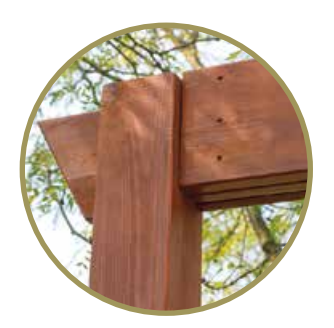
Triple-Ply Headers These heavy-duty headers carry the load of the large arched rafters.