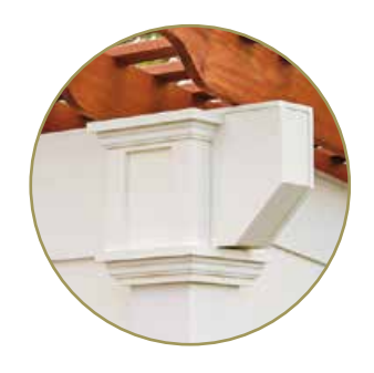
Post Trim The top of each post is covered with this post trim to hide the connecting screws.