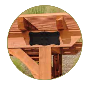
20' Long Units & Longer Includes joining plates.