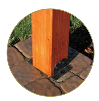
Anchor Brackets These powder-coated anchor brackets attach the pergola to your footers.