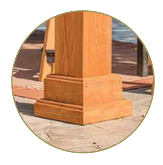
Post Skirts The anchor brackets and bolts are hidden beneath these attractive post skirts.