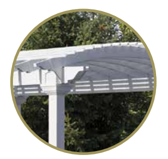
Arched Joists Stand out from the crowd with these continuous arched joists which give your pergola a unique look.