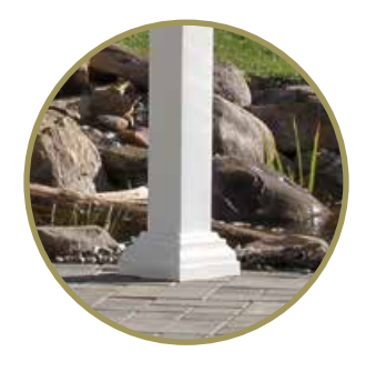
6 x 6 Posts The large 6"x6" posts offer a strong and sturdy base for this unique pergola.